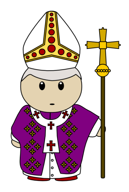
Step 8: (optional) looking good, but not too good

In this day and age, in a society where cash is king, and frugality is the rule of the day, more and more of your clients are going to look for their officiants to have more decorum, and fancy-schmancy, leaving them feeling like they're really and truly getting their money's worth when they choose you to handle their ceremony.