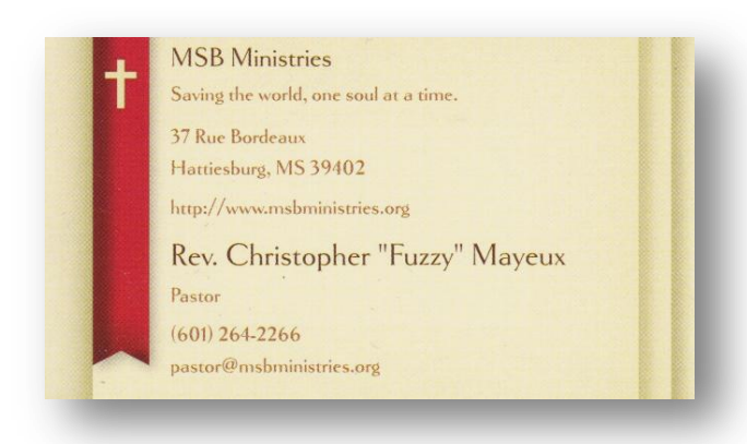
Step 1: Business cards & networking

The first step is a representative object... in this case; it takes the form of a business card. When you are not there, your card is your representative.